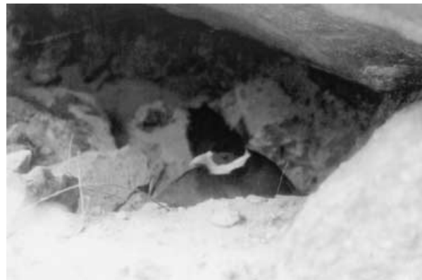
Figure 2. A Tibetan Eared Pheasant hen incubating her nest within a rock cavity.

Nest-sites always had a background object for the nest, such as rocky walls, tree trunks or dense bushes. Among types of objects, the rocky walls were most preferred. Of 54 'rock-dependent' nest-sites, 44 (80.0%) were in rock-cavities (Fig. 2) and ten (20.0%) under projecting rocks. The cavity-entrance size averaged 0.32 m 2 (se = \pm 0.05 , range 0.14–0.98, n = 31 ) and depth 0.70 m (se = \pm 0.09 , range 0.23–1.45, n = 31 ). Outside the cavities, clumps of bushes often camouflaged the nests. The distance from the centre of a nest hollow to the edge of the nest-cavity averaged 5.6 cm (se = \pm 0.9 , range 0–18, n = 31 ), significantly